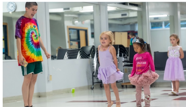
Kids Dance Program