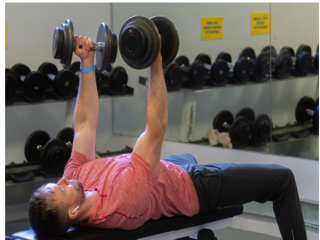
Working out in the Kerrisdale CC Exercise Room