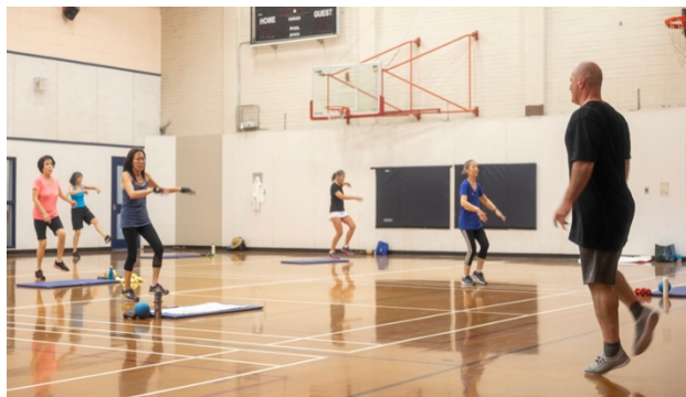
Step Class in the Gym

I want to thank the hard work of the Board of Directors, Community Members and Programmers who worked tirelessly on the Programs Committee this year. It's been an amazing team to work with, and we look forward to another successful year ahead of us.