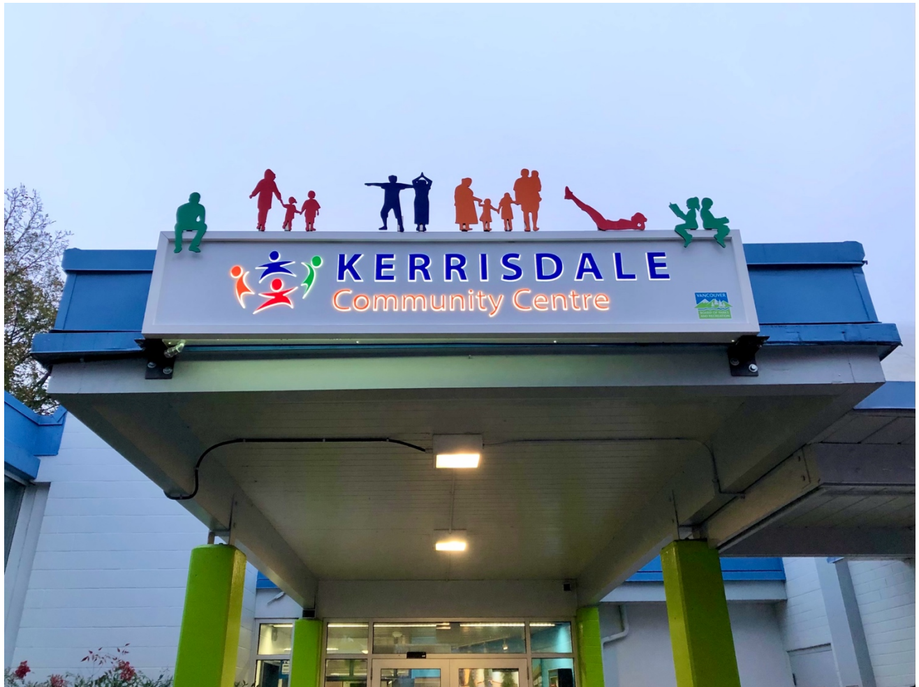
Entranceway signage has refreshed the visual presence of the community centre entrances, making it welcoming and engaging

It is anticipated that resolving some of these tasks may take several months and require coordination.